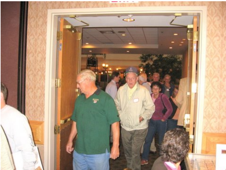
Doors Open and Eager Customers Begin Filing Through