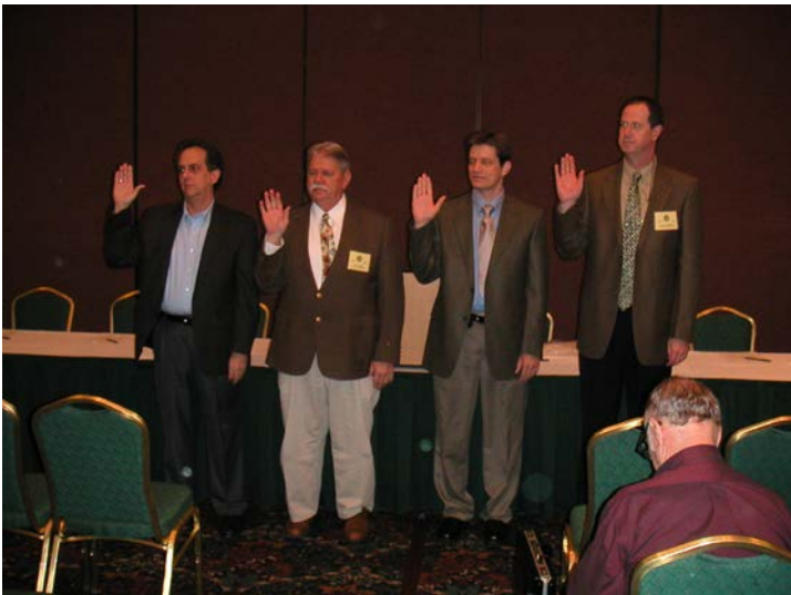
SCNA Officers Taking the Oath of Office