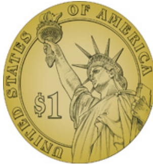
George Washington Obverse Edge-Incused Lettering Statue of Liberty Reverse