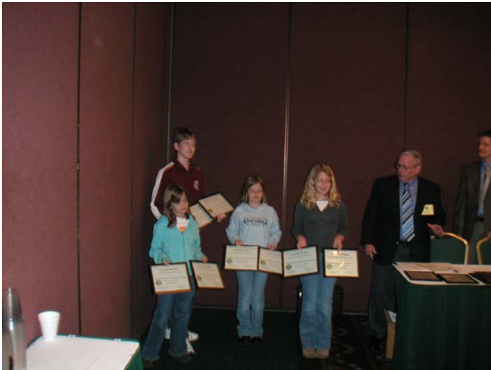
YN Exhibit Winners