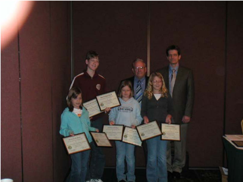
YN Award Winners